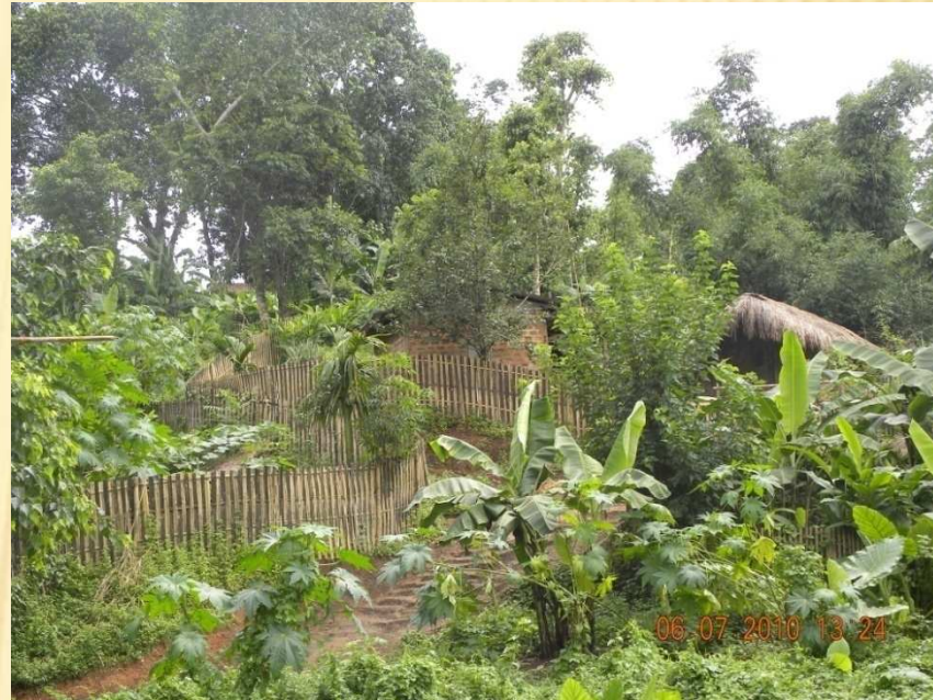
Village of Assam

The region is the habitat of heterogeneous population including various castes and tribes