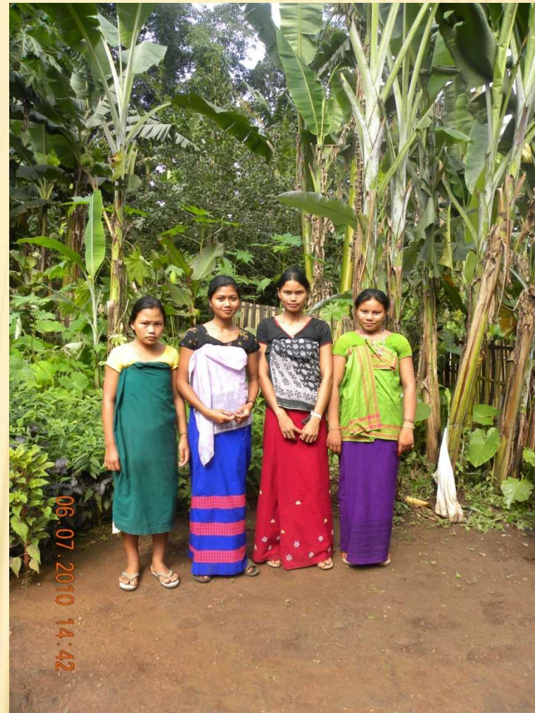
TRIBAL GIRLS IN THEIR TRADITIONAL COSTUMES –